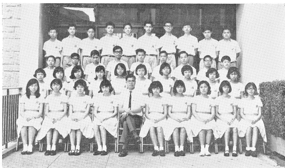
Form Two B