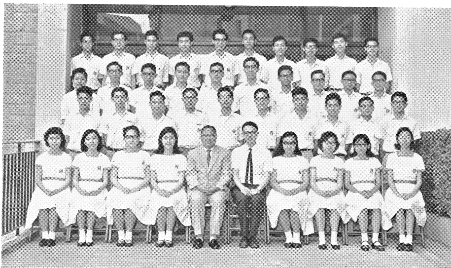
Lower Six Science