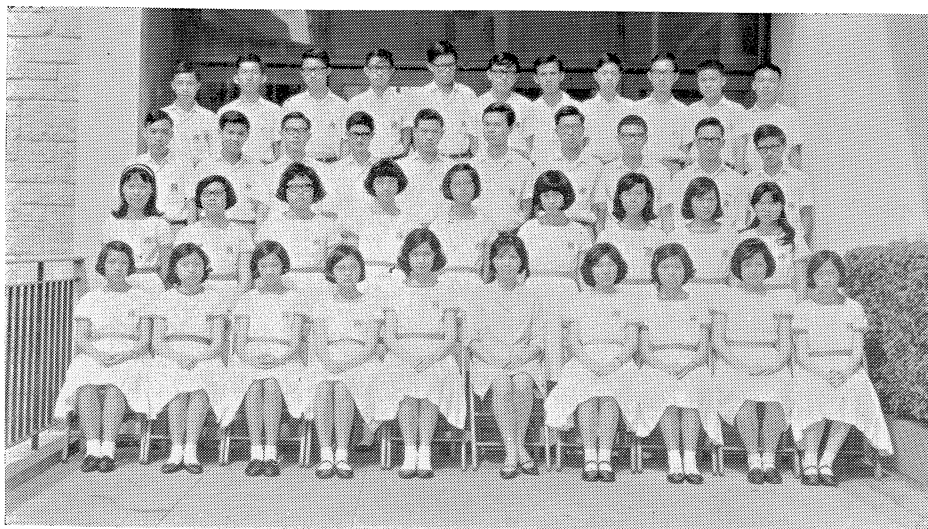
Form Four A