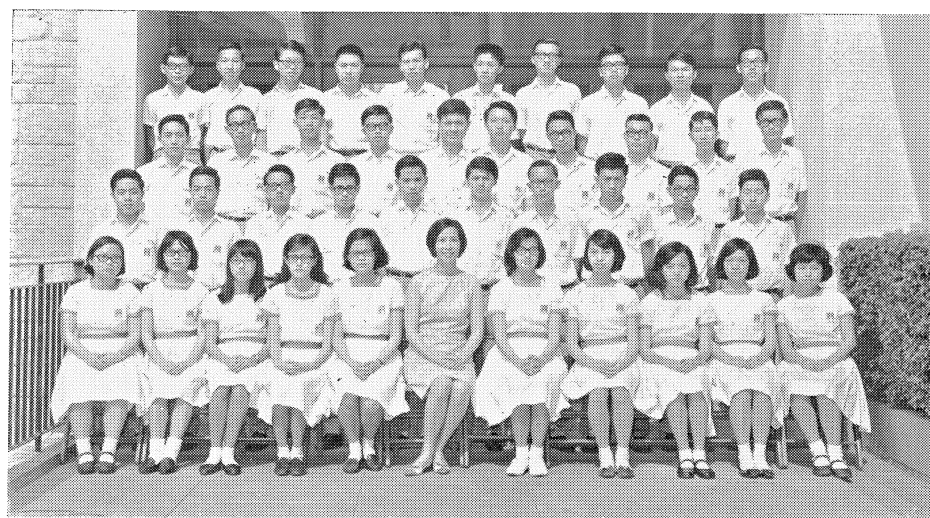
Form Four B