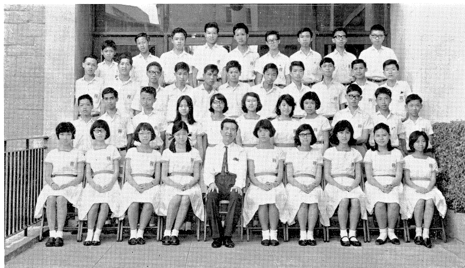
Form Three C