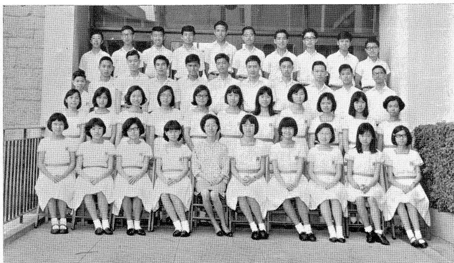
Form Three A