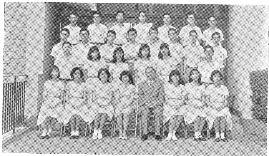
Lower Six Arts