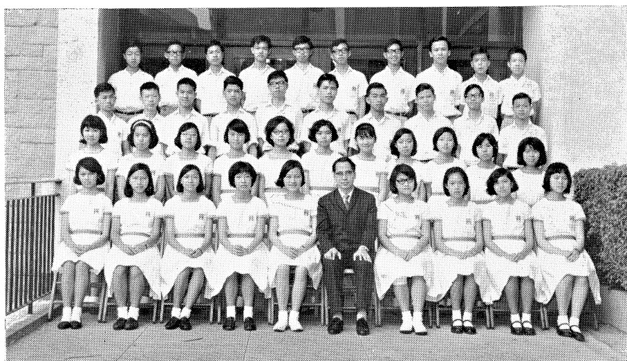
Form Three B