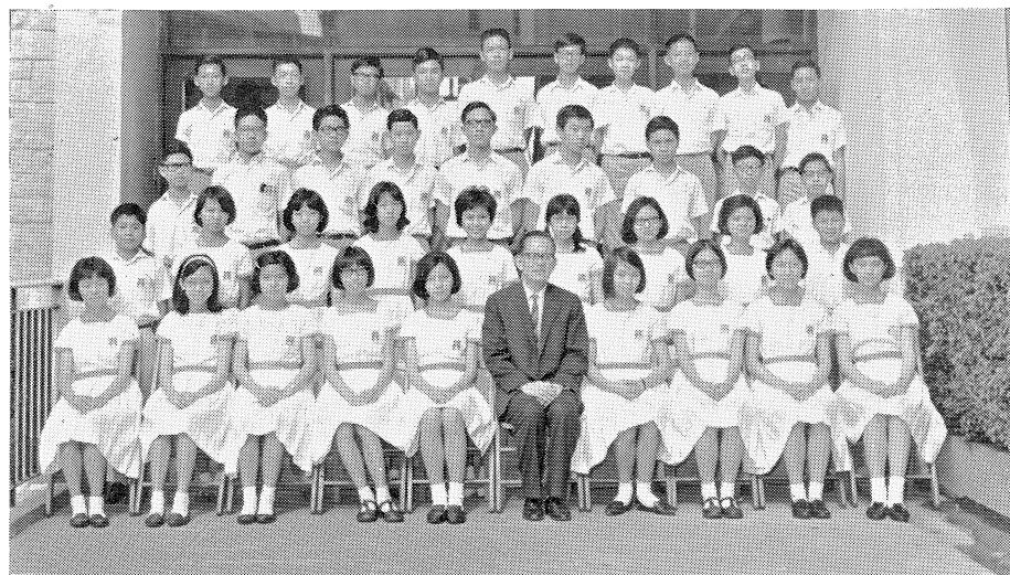
Form Two C