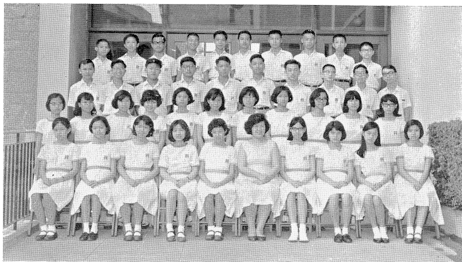
Form Two A