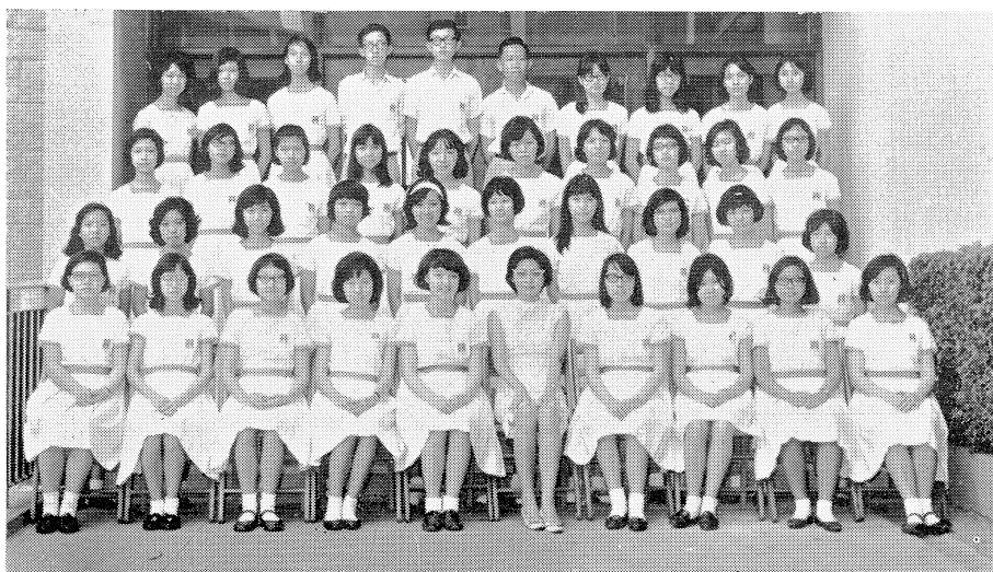
Form Four Alpha