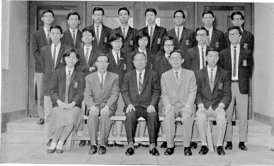
Upper Six Arts